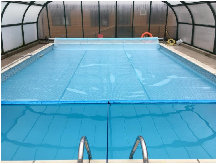
Swimming pool cover